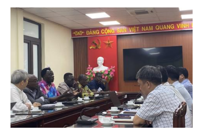
Figure 7: Meeting with officials of Forestry Department, Vietnam