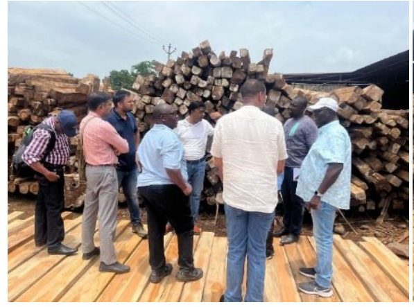
Figure 1: The delegation inspecting imported Ghana Teak (behind) at Vibrant Exim PVT Limited. Beneath are clean square lumber processed from Teak imported from Brazil