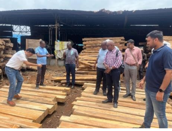
Figure 2: The delegation and representatives from Vibrant Exim PVT Ltd. discussing the observed differences in quality between Teak imports from Ghana and Latin America