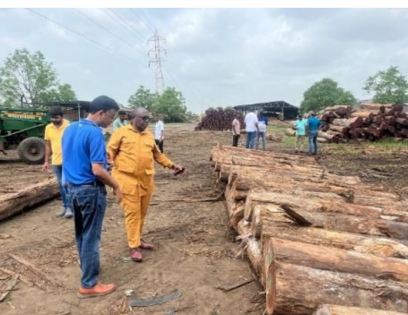
Figure 4: Teak billets from Brazil at Shyam Timber/ Vandana Timber PVT Limited