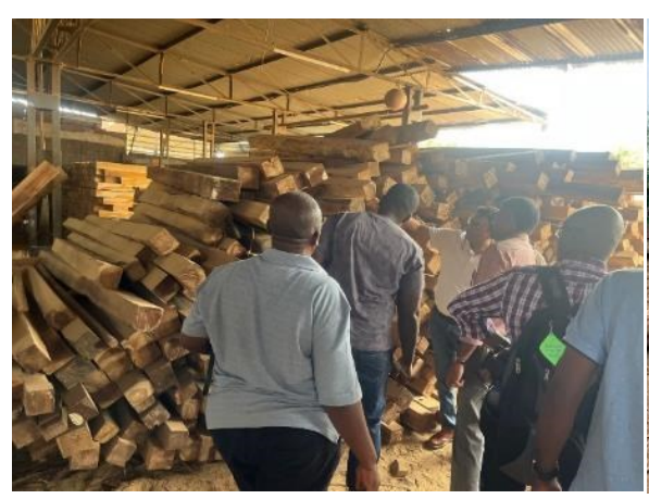
Figure 3: The delegation inspecting processing of Teak at Shree Maruti Enterprise