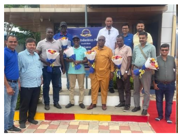
Figure 5: The delegation at Ramhans Industries PVT Limited