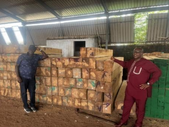
Figure 6: Latin America Processed Teak at Jaypee Sawmill