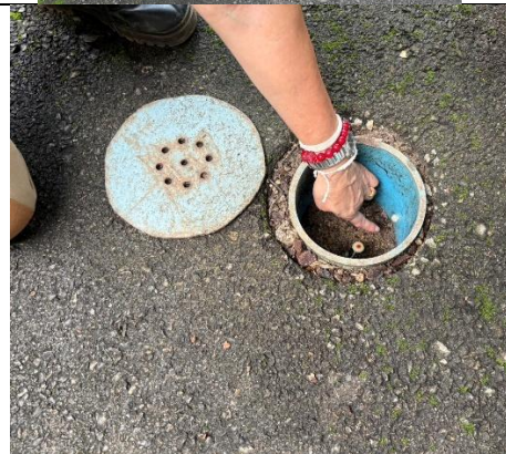
Impact of road payment on old planted Dipterocarp trees ( Dipterocarpus alatus ) and potential mitigation measures (assisted soil respiration)